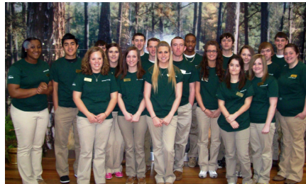
Class of 2009-2010

Leadership Tomorrow produces students that have goals for improving our community and are more qualified to help a community reach its goals. Class members are exposed to many volunteer opportunities throughout the year and are encouraged to “graduate into leadership” instead of graduating from leadership. Graduates of the class have the potential to get more involved in the community and have an understanding of why it is important to continue to give back to the community.